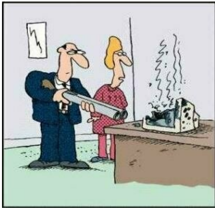
"There are better ways to log off."