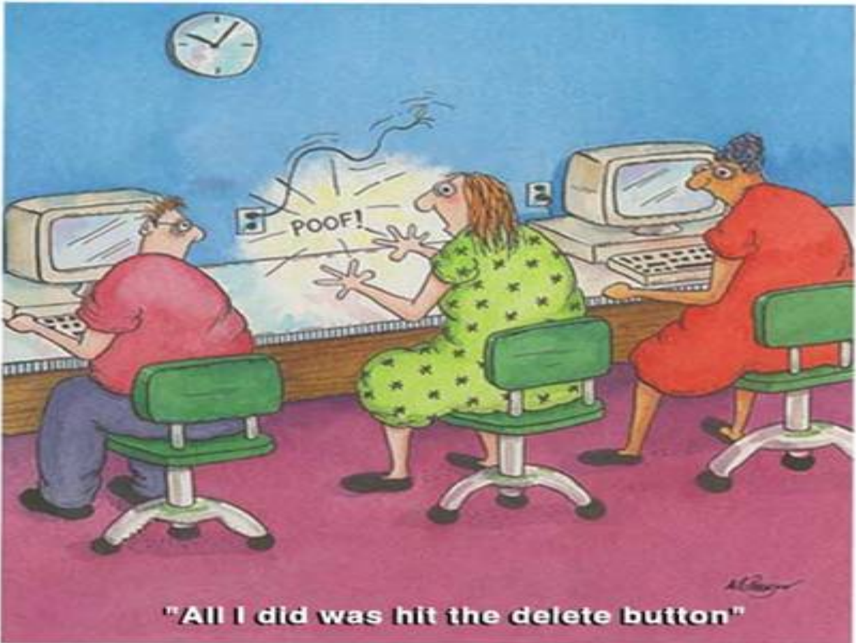
"All I did was hit the delete button"