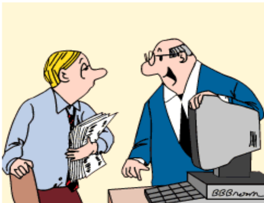
"THIS COMPUTER IS EQUIPPED WITH AN AIRBAG IN CASE YOU FALL ASLEEP!"